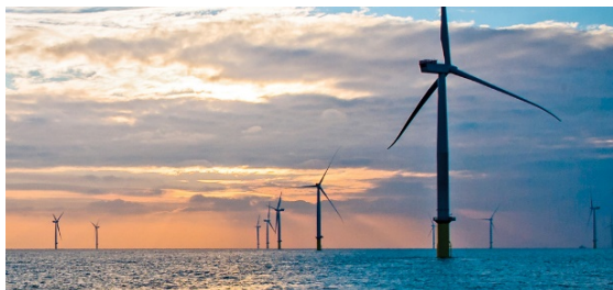
London Array, 20 miles off the Kent Coast

For the first time ever, wind power overtook nuclear power in the first quarter of 2018 as the second largest producer of electricity after gas.