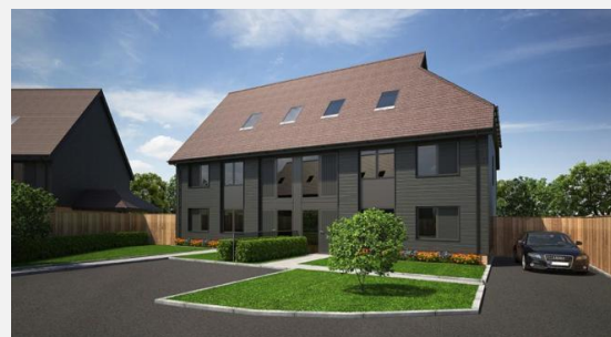
Scocles Court, Isle of Sheppey

The show home opened in September and W&P are looking forward to tracking the energy performance of these Eco homes to see just how much saving can be achieved through design.